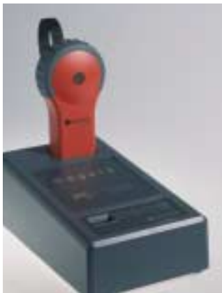
Station box PC