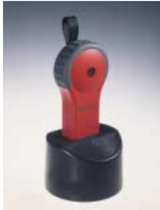
Data Collecting Unit

Electronic Checkpoint System for Security Personnel